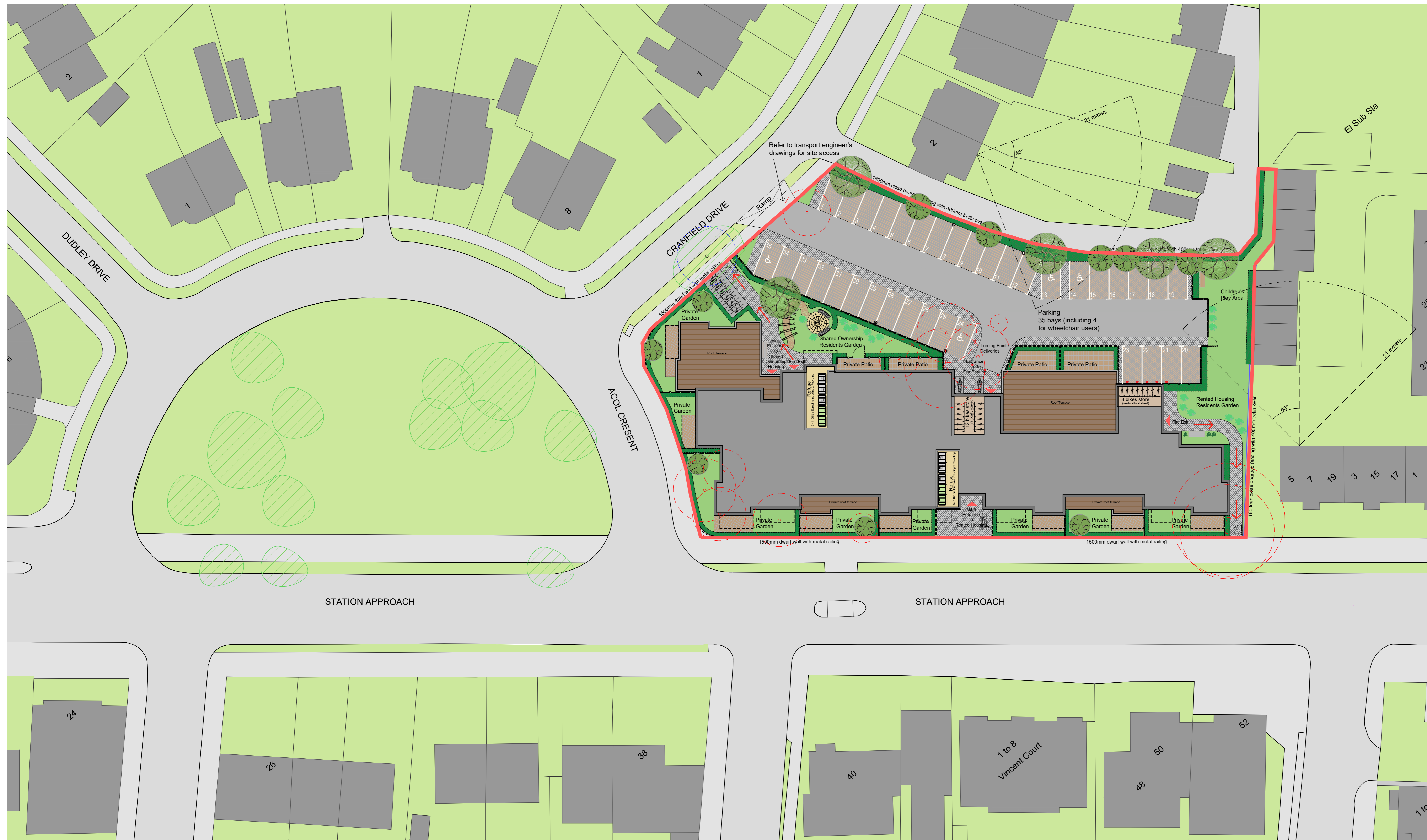
Proposed Site Plan Scale 1:200@A0