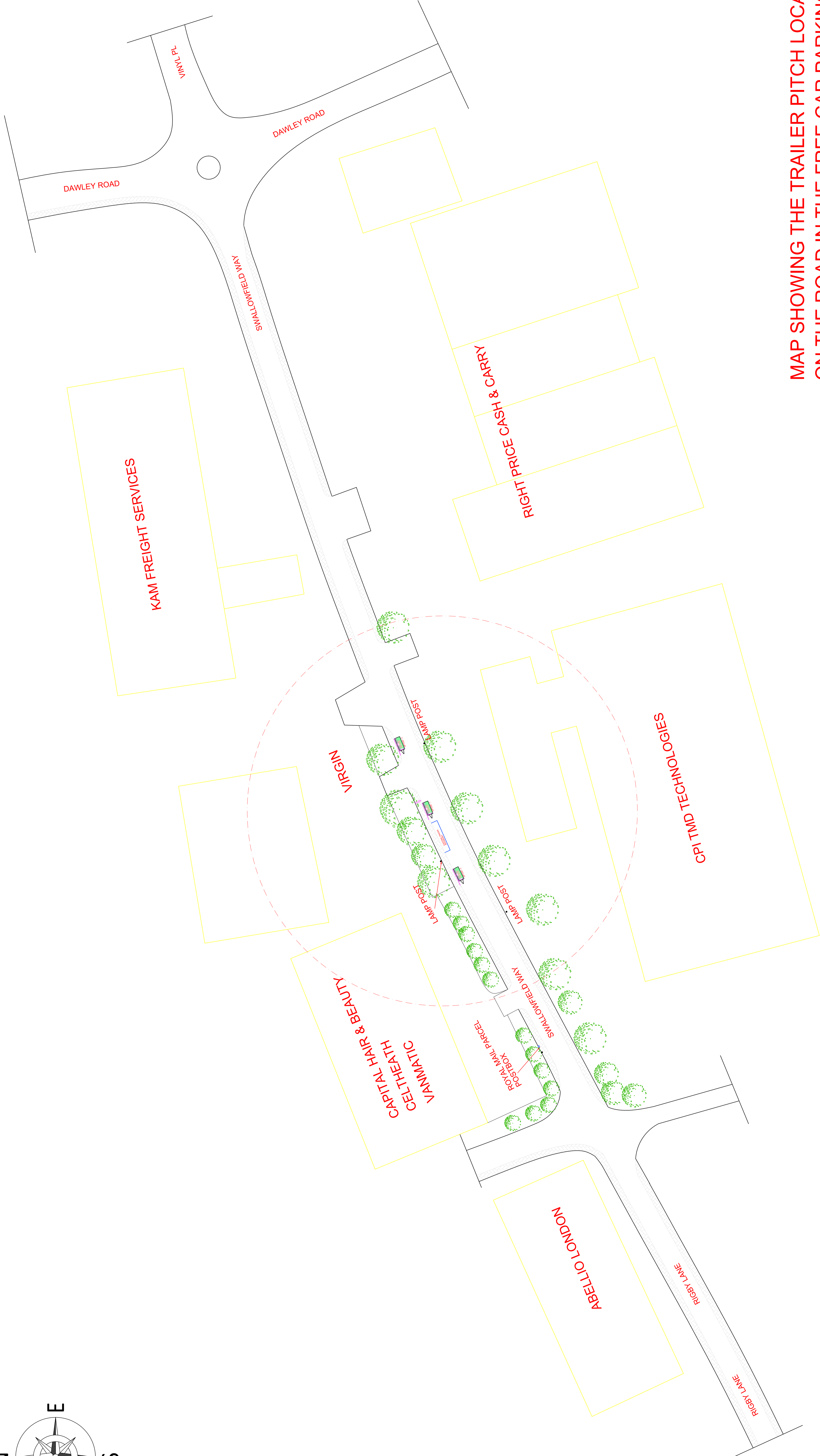
MAP SHOWING THE TRAILER PITCH LOCATION ON THE ROAD IN THE FREE CAR PARKING ADJACENT TO THE EXISTING TRADER