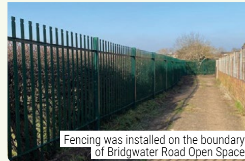
Fencing was installed on the boundary of Bridgwater Road Open Space

the refurbishment of community buildings on council-owned land. Fencing was installed at Bridgwater Road Open Space along the boundary with Victoria Road to secure the site. Bulbs and trees were planted in Rabourmead Drive Open Space to enhance the area for residents and increase biodiversity. Find out more at www.hillingdon.gov.uk/chrysalis .