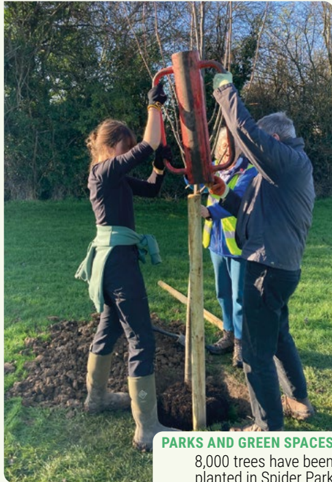
PARKS AND GREEN SPACES 8,000 trees have been planted in Spider Park