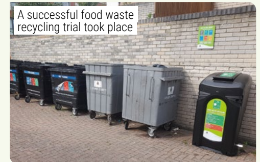
A successful food waste recycling trial took place

started to expand its food waste recycling service to council-owned blocks of flats.