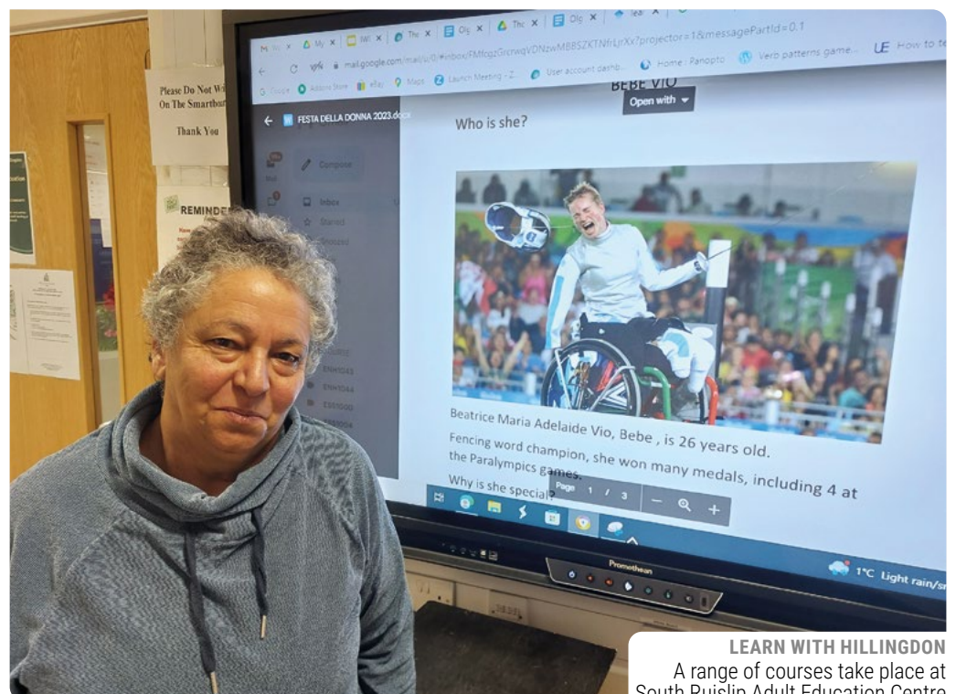
LEARN WITH HILLINGDON A range of courses take place at South Ruislip Adult Education Centre