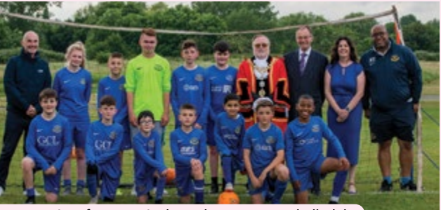
Representatives from Bessingby Park Rangers Football Club

"I recently wrote to the Department of Transport suggesting that construction work should cease whilst the review took place but unfortunately that is too much of a common sense approach for this project."