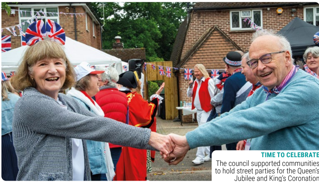
TIME TO CELEBRATE The council supported communities to hold street parties for the Queen's Jubilee and King's Coronation