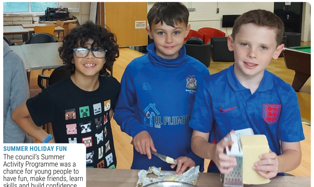
SUMMER HOLIDAY FUN The council's Summer Activity Programme was a chance for young people to have fun, make friends, learn skills and build confidence