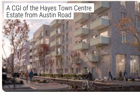
first phase will create 110 new homes: 30 at Avondale Drive and 80 at Hayes Town.