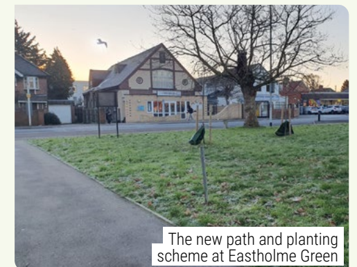
The new path and planting scheme at Eastholme Green