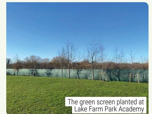
The green screen planted at Lake Farm Park Academy